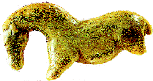
Carved Horse, Antler France

In the Neolithic period , humanity had domesticated some animals (dogs and cattle) and some grains. This enabled them to settle down in one place instead of following the herds that were their major food source. Soon villages grew and human population stabilized and became sedentary. This led to the creation of civilization and eventually cities.