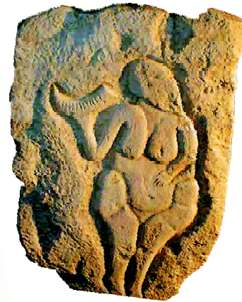
Venus of Laussel c.20,000-18,000 BC, Limestone 17 inches