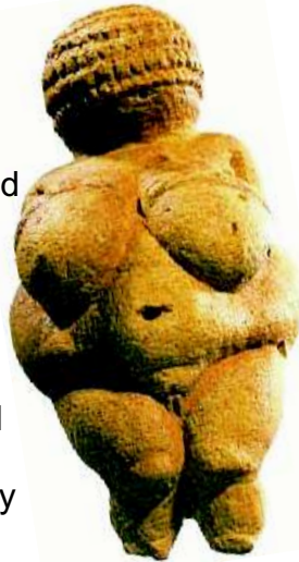
Venus of Willendorf, 15,000-10,000 BC, Stone 4 3/8 high

The early men also sculpted. They modeled in clay and carved small fetish figures out of ivory, bone, antlers and stone. These often represented animals and sometimes-human portraits. Very often they carved pregnant or obese women whose breasts and bellies were exaggerated while their heads, feet and hands were minimal. It is believed by many today that these fetish figures were designed to give those who owned them some kind of power over their spirits of the figures they represented. The female figures may have represented a desire to become pregnant since the continuation of life was of prime importance and pregnancies were difficult and infant mortality rates were high.