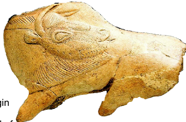
Bison with Turned Head, La Madeleine, c.11,000-9,000 BC. Reindeer Horn 10.5cm Dordogne, France

In the Neolithic period , humanity had domesticated some animals (dogs and cattle) and some grains. This enabled them to settle down in one place instead of following the herds that were their major food source. Soon villages grew and human population stabilized and became sedentary. This led to the creation of civilization and eventually cities.