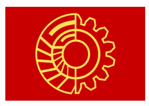
Communist Party of Canada