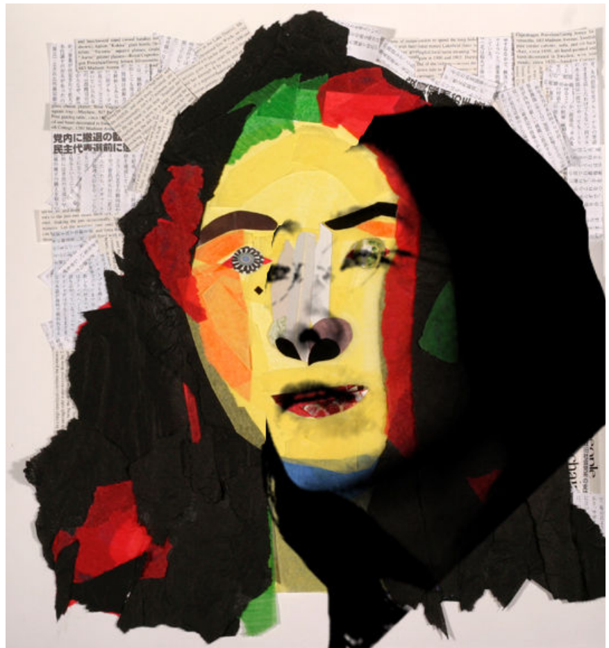
Mixed Media Self Photo Portraits